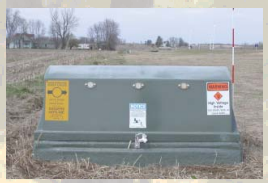
A nice clean underground cabinet is pictured here. When these cabinets are inspected, they are checked for damage inside and out and checked to see if they are working properly. Our contractor makes sure that proper identification stickers are placed correctly, and most important that equipment is locked. They also make sure that there is no debris around the equipment.

our Operations Department will be happy to help. You can also make sure that trees are not planted in the overhead line's right-of-way. By doing this, you will save the expense of trimming the tree, because we will have to remove it in the future during our annual right-of-way maintenance. But the most important reason for careful planting is that trees and power lines don't go well together. They cause electrical blinks and outages when they are exposed to the line.